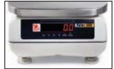
Valor 2000 with standard rear LED display